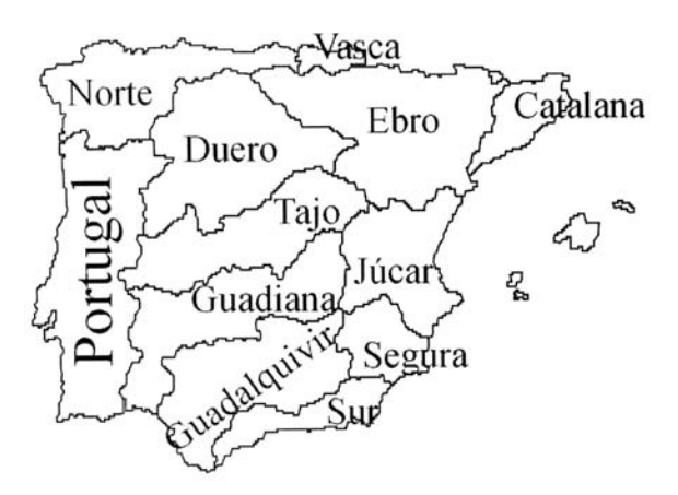
Figure 1. Watersheds distribution in Spain. Distribución de las cuencas de drenaje en España.

The data analyzed in this paper correspond to samplings conducted along the year, and not only at the typical moment of cyanobacterial blooming in many Spanish reservoirs (end of